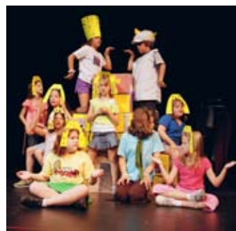
Young Artists at Play